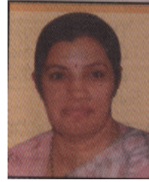
Smt. D. Purandeswari Minister of HRD