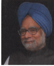
Dr. Manmohan Singh Hon'ble Prime Minister